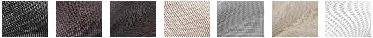
Black Black Brown Brown Desert Sand Dusk Grey Sandstone White