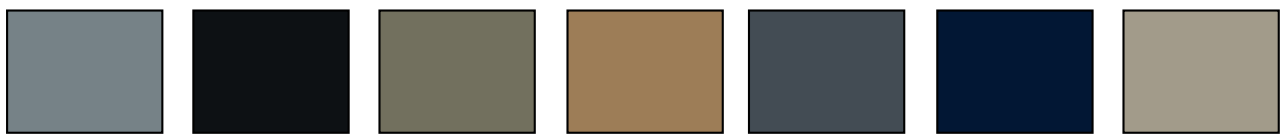
Aluminum Black Pepper Antelope Concrete Marine Hemp