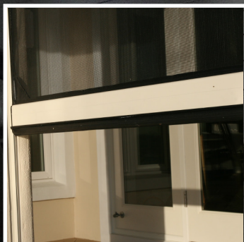
One installation method for all sizes