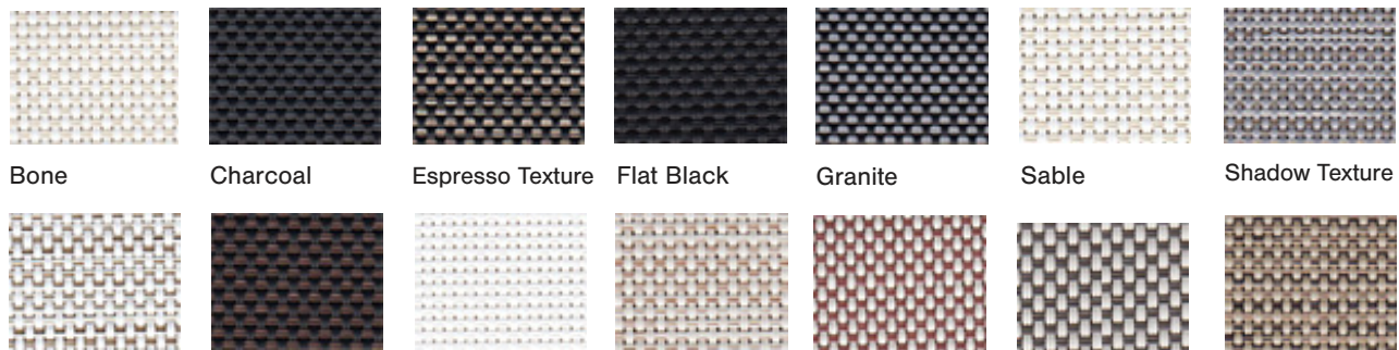
Bone Charcoal Espresso Texture Flat Black Granite Sable Shadow Texture Stone Texture Tobacco White Desert Sand Almond Cafe Tumbleweed